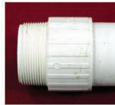
A 2" Male Adaptor

A length of 2" PVC pipe long enough to reach the bottom of the basin