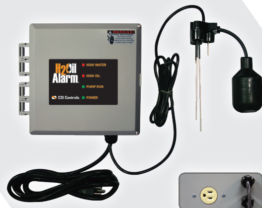
Receptacle on bottom of panel 115V model shown