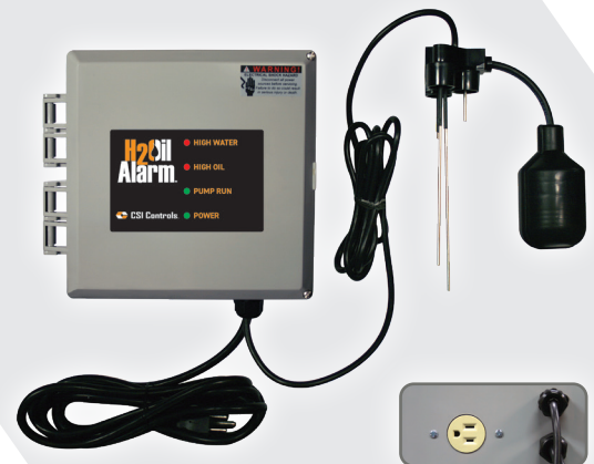
Receptacle on bottom of panel 115V model shown