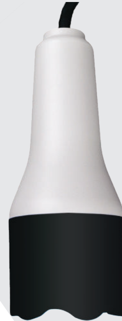
US Patent 8,336,385