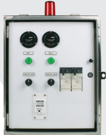
Model Shown: 1059961 VIP-331SS